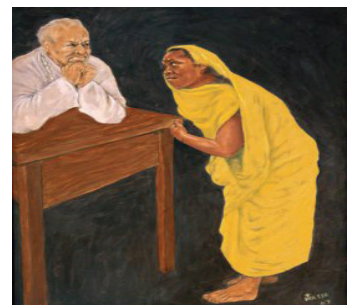
The Persistent Widow!

Next weekend is World Mission Sunday, Envelopes for this Special collection are at the entrance of the church for your use this week.